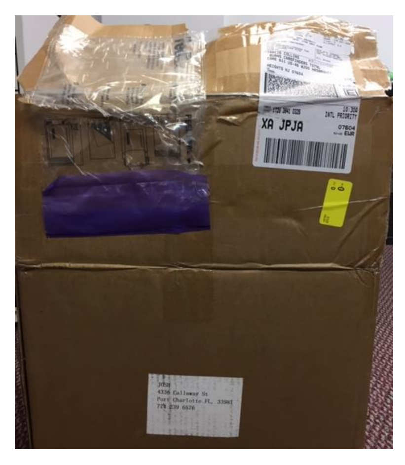
NPPTL COVID-19 Response: International Respirator Assessment