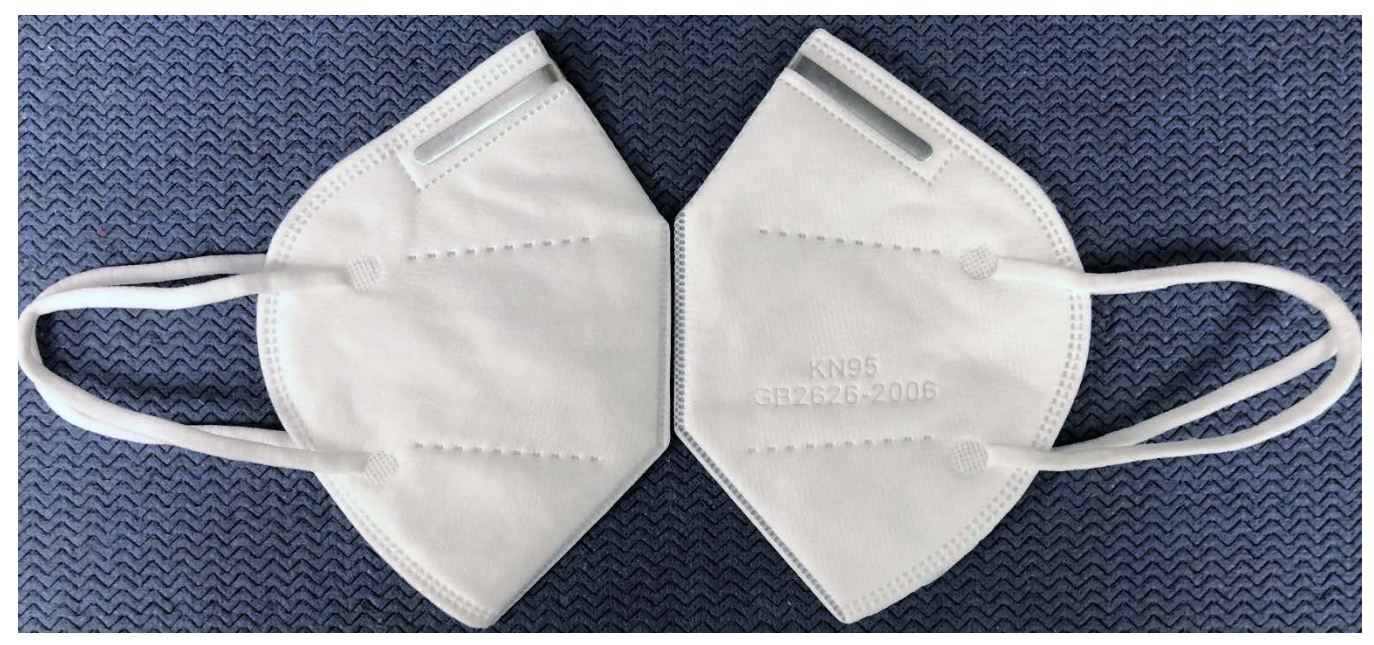
NPPTL COVID-19 Response: International Respirator Assessment