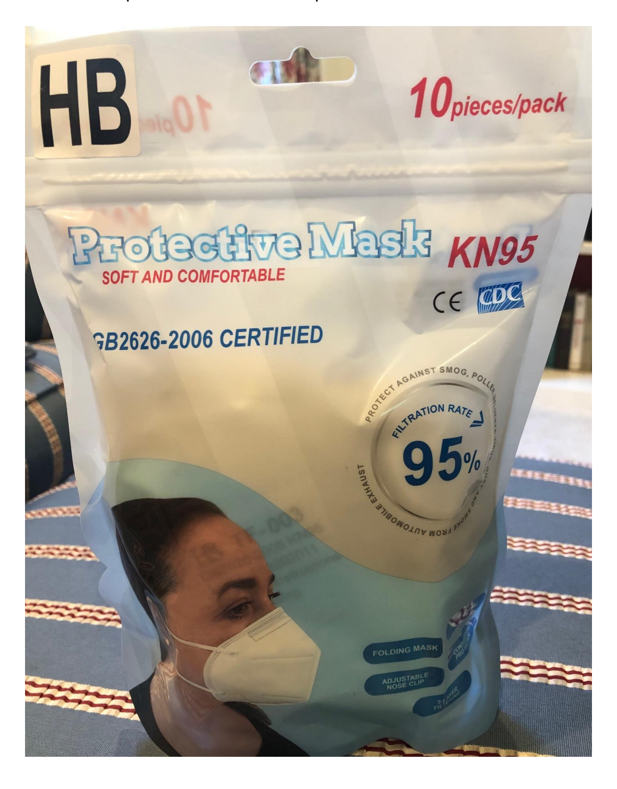
NPPTL COVID-19 Response: International Respirator Assessment