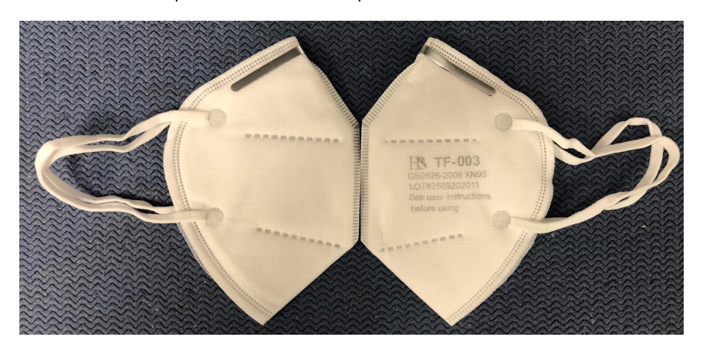
NPPTL COVID-19 Response: International Respirator Assessment