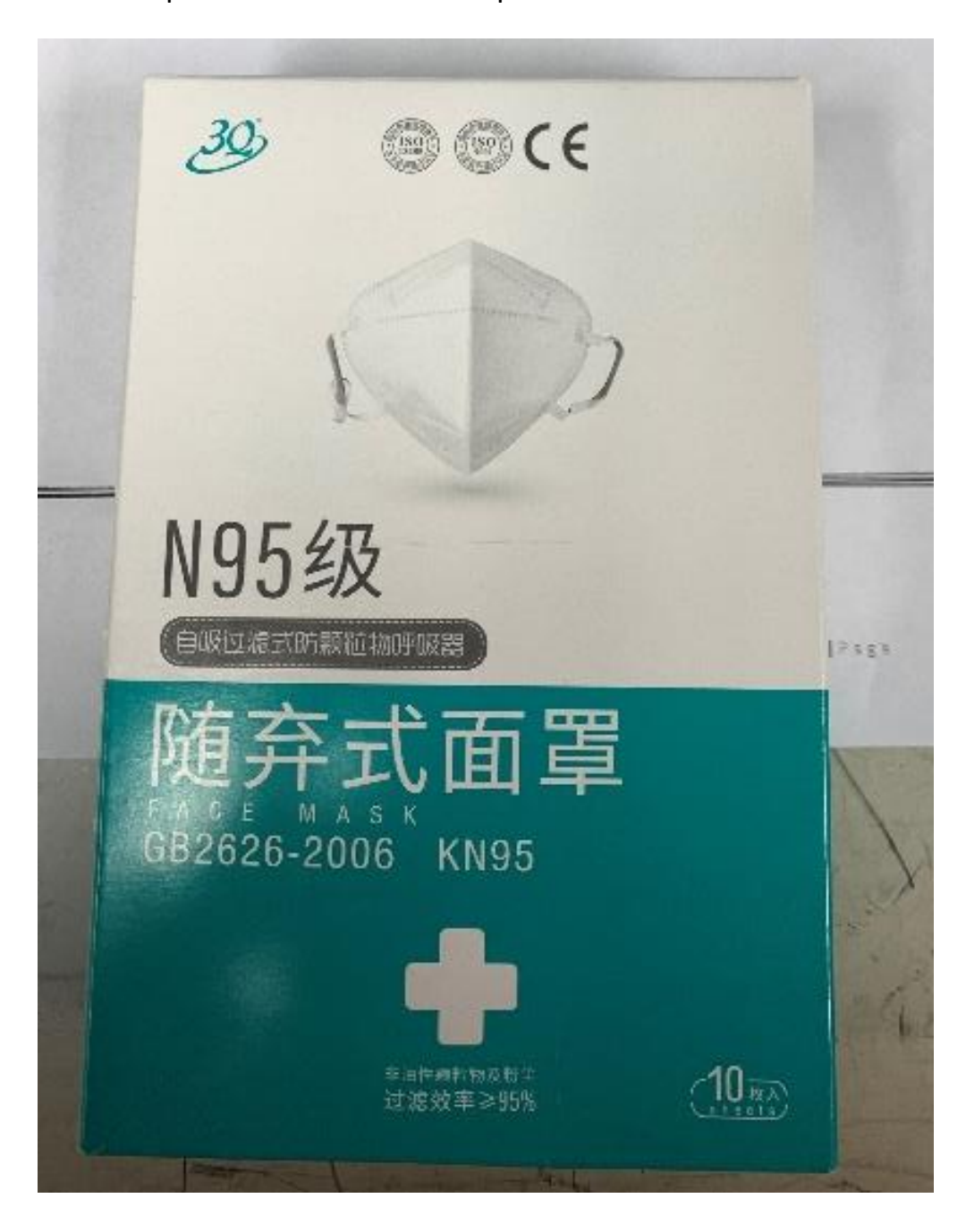
NPPTL COVID-19 Response: International Respirator Assessment