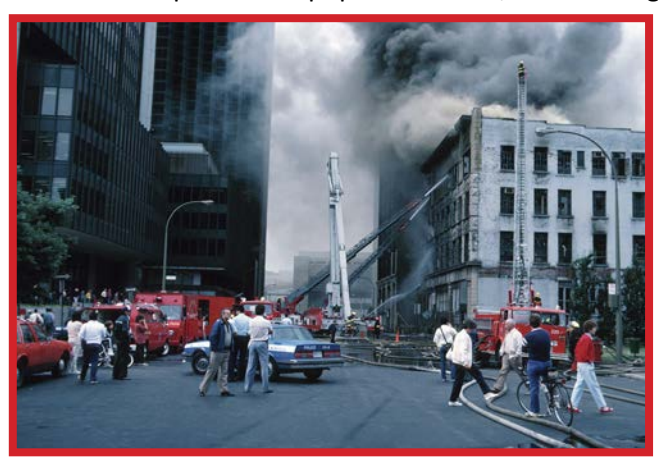
Monitoring and surveillance helps to document and track incident personnel health status during and after an incident

scope of injury and illness, and planning for the next event.